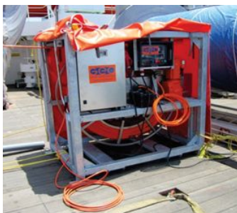
cable reel for deep water.

We also offer the constant tension winch with 1000 m umbilical for deep water.