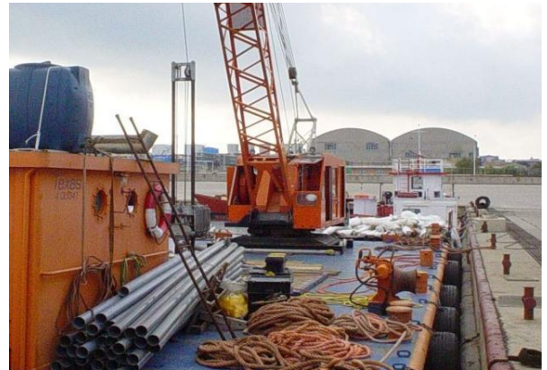
From a barge or multi-cat using big crane.