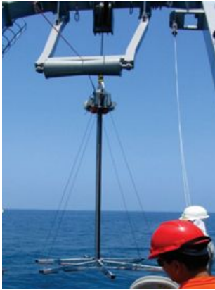
From the stern using the A-frame plus hoisting winch.

- THE GEO-CORER HAS A VARIABLE FOOTPRINT AND A PIVOTING BARREL, WHICH ALLOWS DEPLOYMENT IN ALL KINDS OF SITUATIONS -